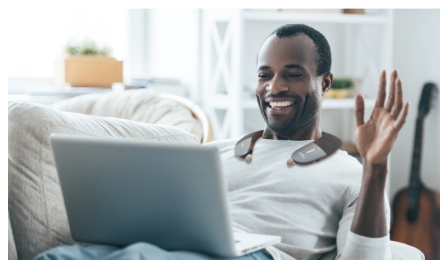
Mobile Calls & Streaming